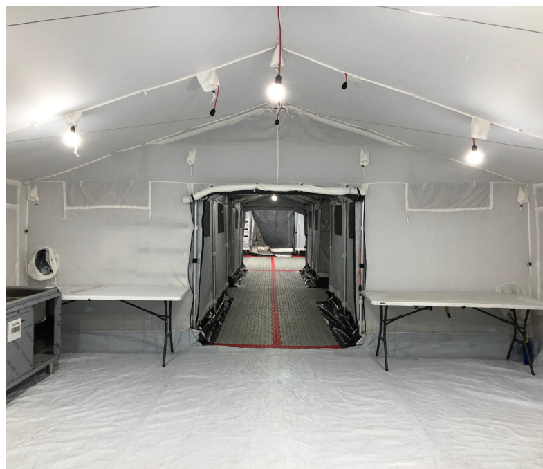
Lighting kit in combination with inner liner

Specifications & design may be altered without notice due to continuous product development. LAST UPDATED 6/2023