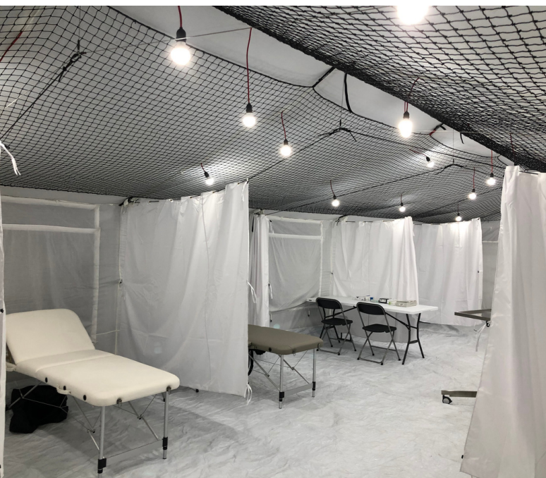
Lighting kit in combination with separation curtains and ceiling net