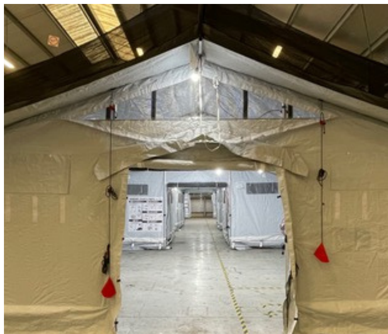
1 light bulb outside tent on each gable