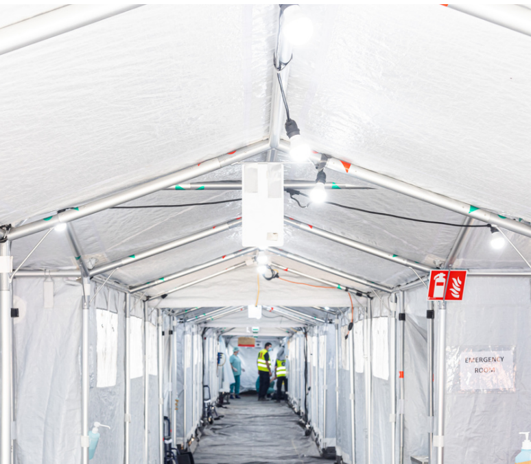
Light bulbs inside tent